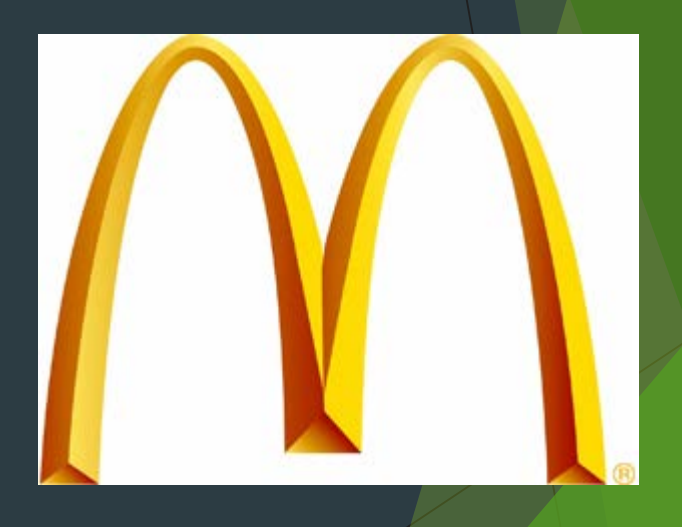
© 2016 Balough Law Offices, LLC