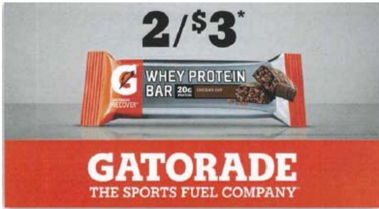
Hartshorn Dep., Ex. 8.