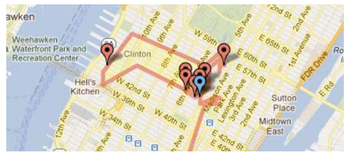
Sites Visited by Lost Smartphone #N2

The Symantec Smartphone Honey Stick Project is an experiment involving 50 "lost" smartphones. Before the smartphones were intentionally lost, a collection of simulated corporate and personal data was placed on them, along with the capability to remotely monitor what happened to them once they were found.